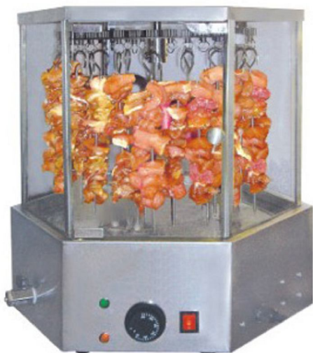
KEBAB GRILLER ELECTRIC KEBAB GRILLING MACHINE