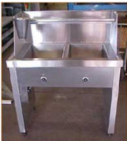
2X 20 LITRE DOUBLE BOWL GAS FRYER