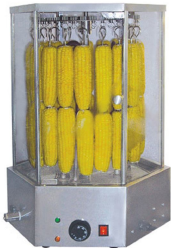
CORN GRILLER ELECTRIC CORN GRILLING MACHINE STAINLESS STEEL TABLE ( FOR BOTH CORN AND KEBAB MACHINES )