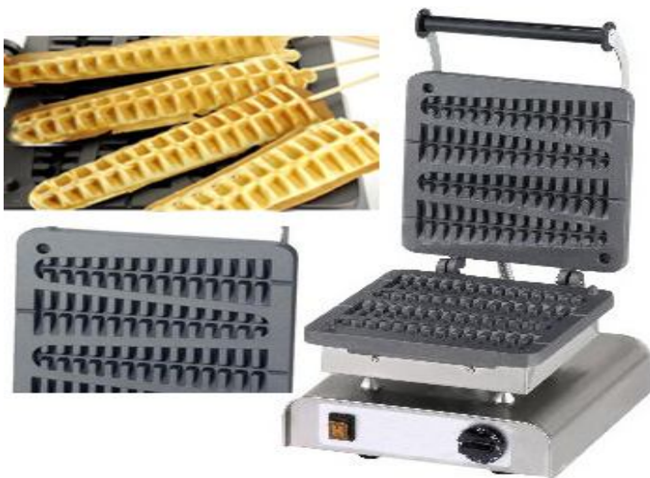
WAFFLE LOLLY BAKER