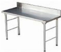
STAINLESS STEEL TABLE