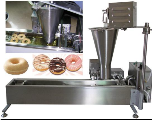
SEMI AUTOMATIC DONUT MACHINE

ELECTRIC MINI DONUT FRYER STAINLESS STEEL TABLE