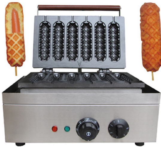
MUFFIN HOT DOG BAKER