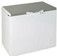
CHEST DEEP FREEZE