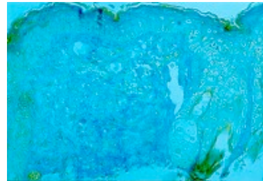
Photo. 2: Skin section after UVA irradiation and treatment with 5% BIOPEPTIDE-CL (i.e. 5 ppm Pal-GHK) for one week. The collagen fiber density is greater than that for the UVA-irradiated sites. (Magnification: x317).