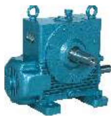
Modular Worm Gearbox