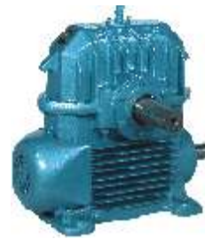
Heavy Duty Worm Gearbox