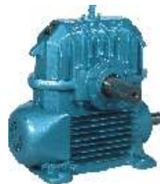
Heavy Duty Worm Gearbox