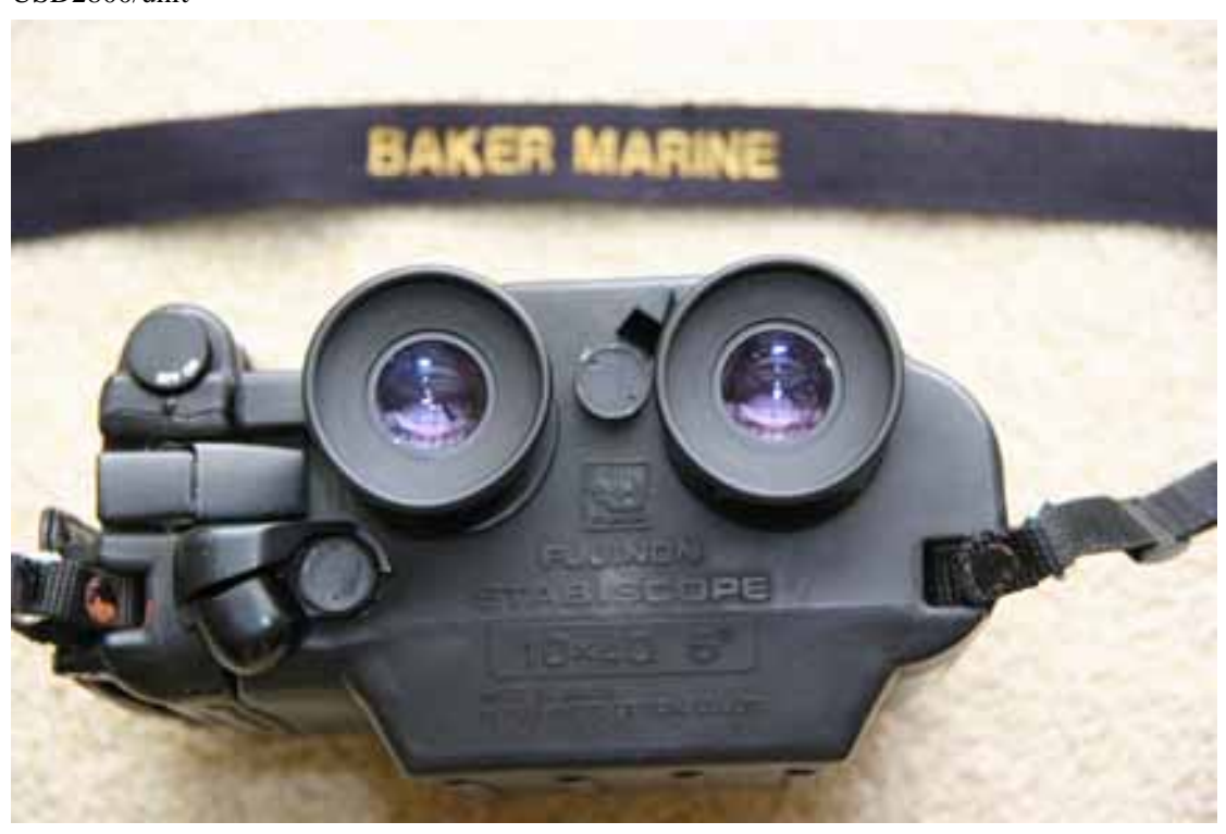
Magn. x Objective Lens Dia.: 12 x 40