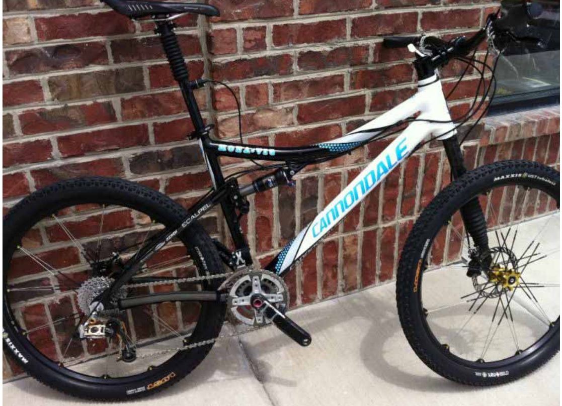
Monavie-Cannondale team paint job looks gorgeous! Custom build kit and