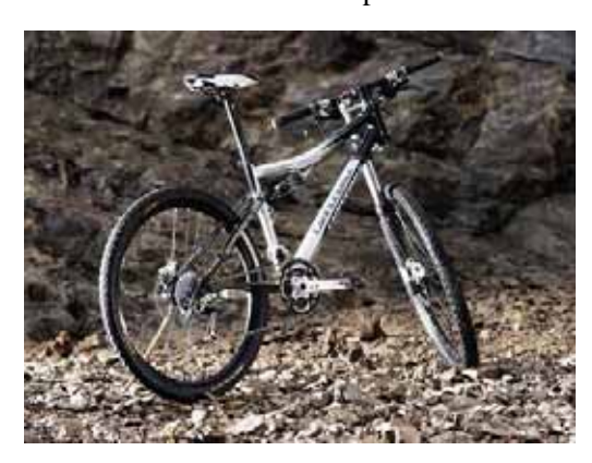
New 2011 Cannondale Scalpel Carbon Team Bike: USD1600/unit