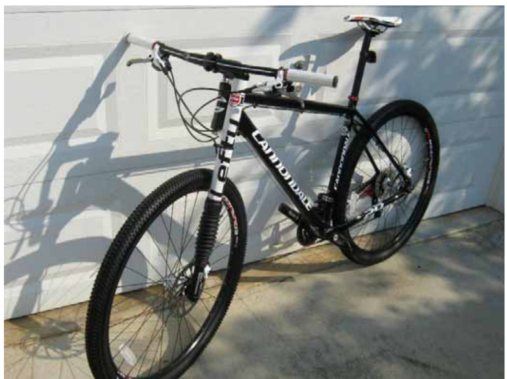
This 2011 XL Cannondale Flash 29 1 is Brand New, FrameFlash, SmartFormed alloy, SAVE, BB30, 1.5 Si head tube ForkLefty Speed PBR, 100 mm, OPI, Solo Ai CrankFSA AFTERBURNER 386 BB30 39/27 ChainKMC X10SL 10-speed