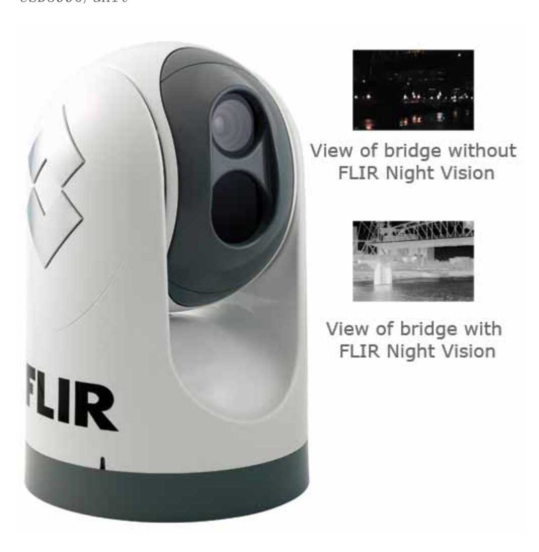
FLIR M-Series Premium Multi-Sensor Marine Night Vision System USD3990/unit