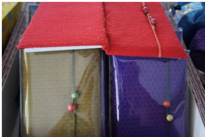
Cover the document file