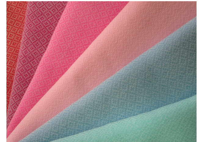
Look Kaew pattern, Price: FOB Thailand 8.64 US$ / Yard

Note: The PRICE can be negotiated and for MORE PATTERNS and styles, please don't hesitate to contact us.