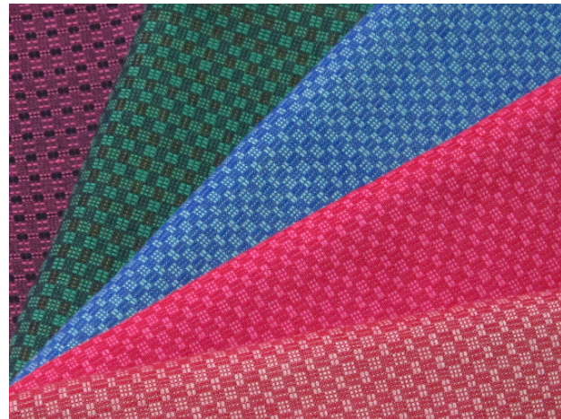
5+1 pattern, Price: FOB Thailand 8.64 US$ / Yard