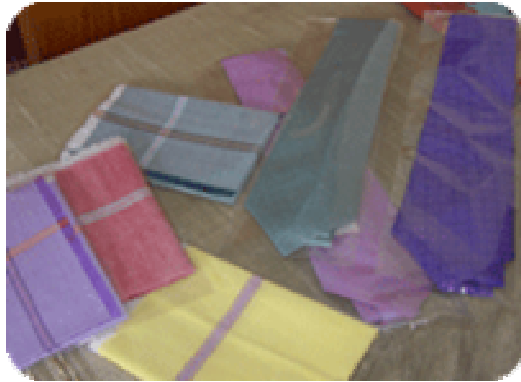
Table napkin or handkerchief