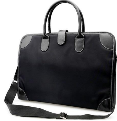
Cross World: Men's