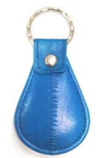
Eel Skin Goods