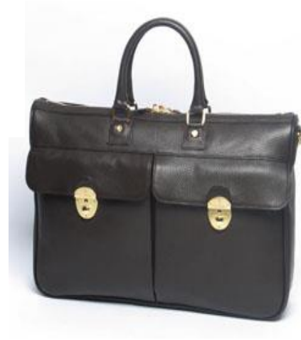
Brooks Brothers: Men's