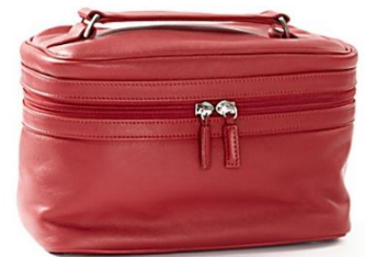
Leatherology: Leather Bag