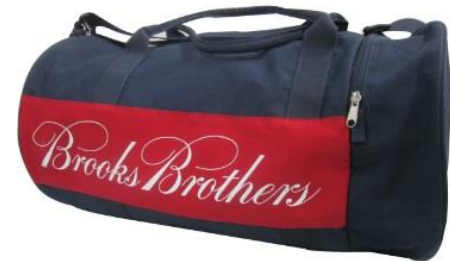
Brooks Brothers: Men's