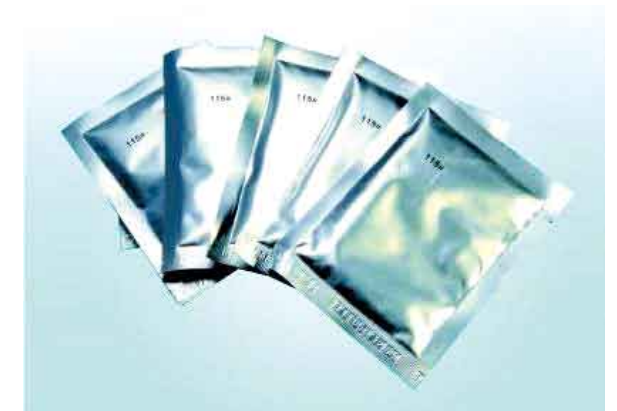
Aluminum weld thermite powder