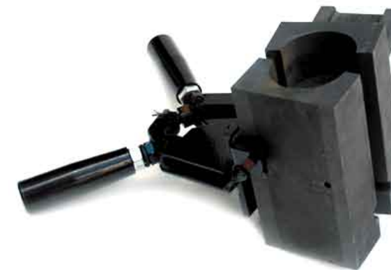
Aluminum weld thermite mould