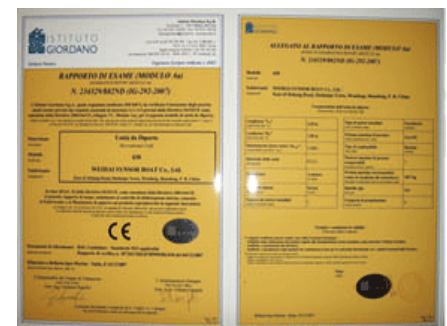
CE For 430