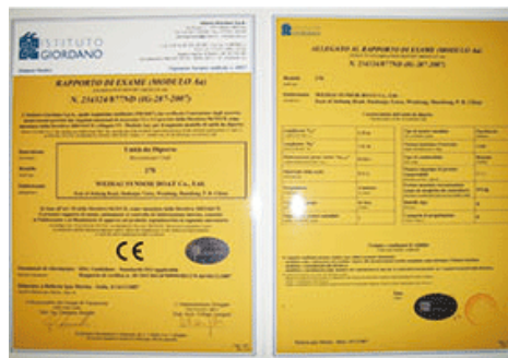
CE For 270