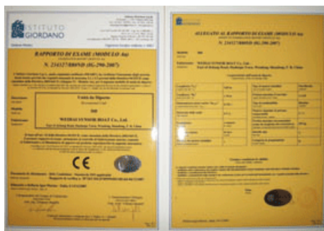
CE For 360