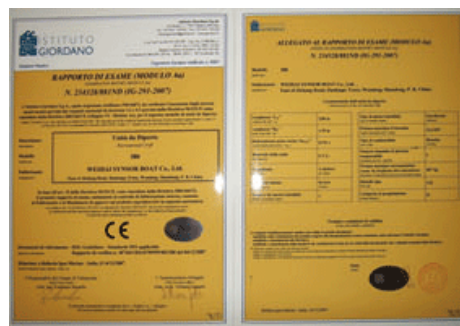
CE For 380