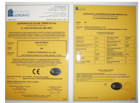
CE For 290