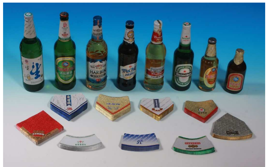
Production and Packing