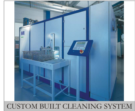
CUSTOM BUILT CLEANING SYSTEM

For large cleaning volumes and high degree of cleanliness level, either large capacity single tank systems or multi-chamber systems are offered with solvent or water based cleaning media, complete with recirculation, filtration and material handling system.