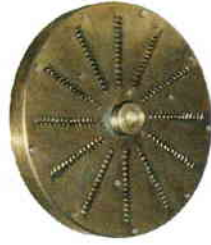
Fine Chips Wheel No. C-7