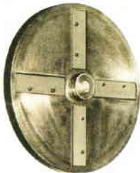
Chips Wheel No. J-3